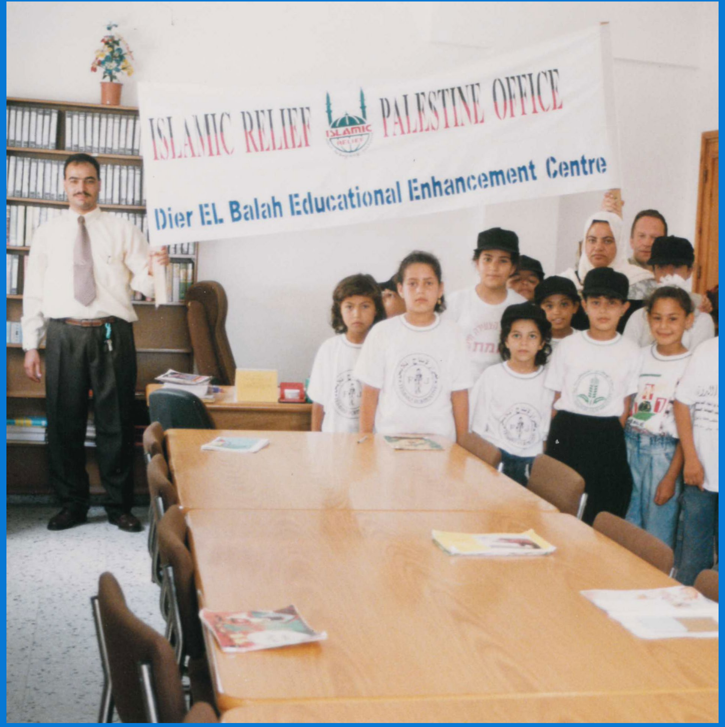
Islamic Relief staff with children attending the Deir El Balah Educational Enhancement Centre

"For us, the centre was the third home after our real home and school. We participated in Kanaan Parliament for children, in which we discussed many problems facing children and suggested suitable solutions. We worked hard to publish booklets in which we try to enlighten children and let them know their rights and duties. I have enjoyed very much the toy library that includes different games, toys and educational and entertainment videotapes. Also, I have learned how to use a computer."