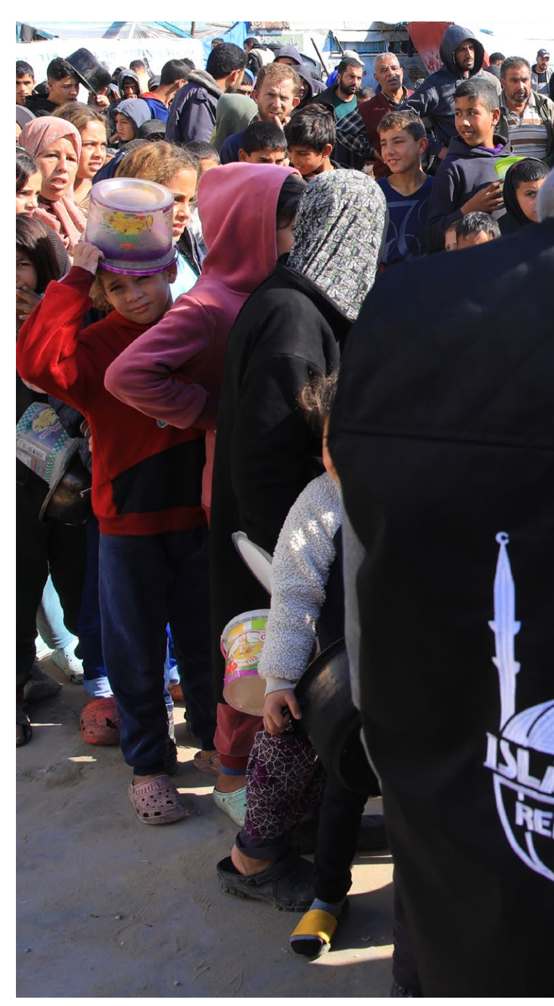
Middle area, January 2025 - Families queue for an Islamic Relief distribution

International governments must not be complicit in Israel's illegal occupation. We will continue to call on and pressure governments to end arms sales and take other political action to ensure Israel abides by international law. Above all, the horror of the past 15 months must not be forgotten and there must be justice and accountability for the repeated violations of international law, Israel's brutal collective punishment of an entire population, and its complete disregard for the measures ordered by the International Court of Justice to prevent genocide.