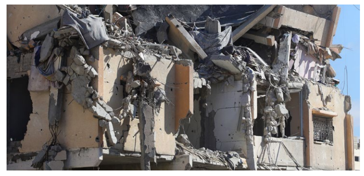
Some 69 per cent of Gaza's buildings have been flattened or damaged