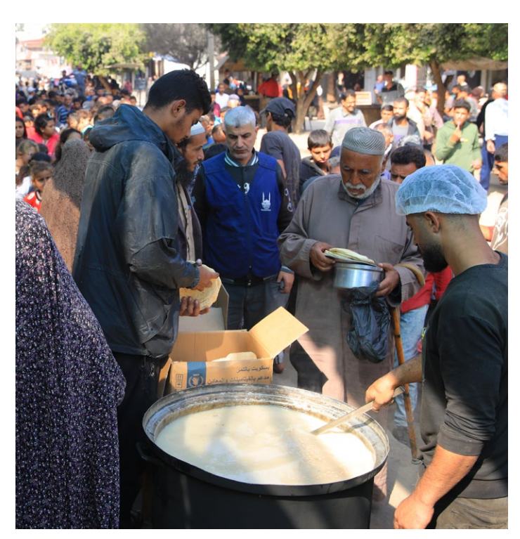
Islamic Relief distributes hot meals to displaced Palestinians in Gaza

Islamic Relief teams and local partners have remained within Gaza since the escalation began. Throughout the past 500 days, our focus has been on providing emergency relief wherever possible, as we have done during each and every escalation since we began working in Gaza in 1997.