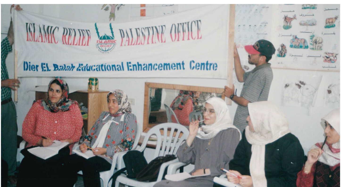
Islamic Relief has been supporting vulnerable people in Palestine for nearly 30 years

Islamic Relief is working to alleviate the intolerable suffering of the Palestinian people and reach those that are most vulnerable to prevent further deaths. We will step up our emergency response efforts to increase protection for those most affected, and, when the time comes, support with repairing, rebuilding, and strengthening vital services, facilities and infrastructure. We hope to help get children back to school, get hospitals and specialist care centres back up and running, and implement other longer-term development programmes that empower communities to rebuild self-reliance in a sustainable manner. We will continue to campaign for an end to Israel's illegal occupation of Palestine, so there can be lasting peace.