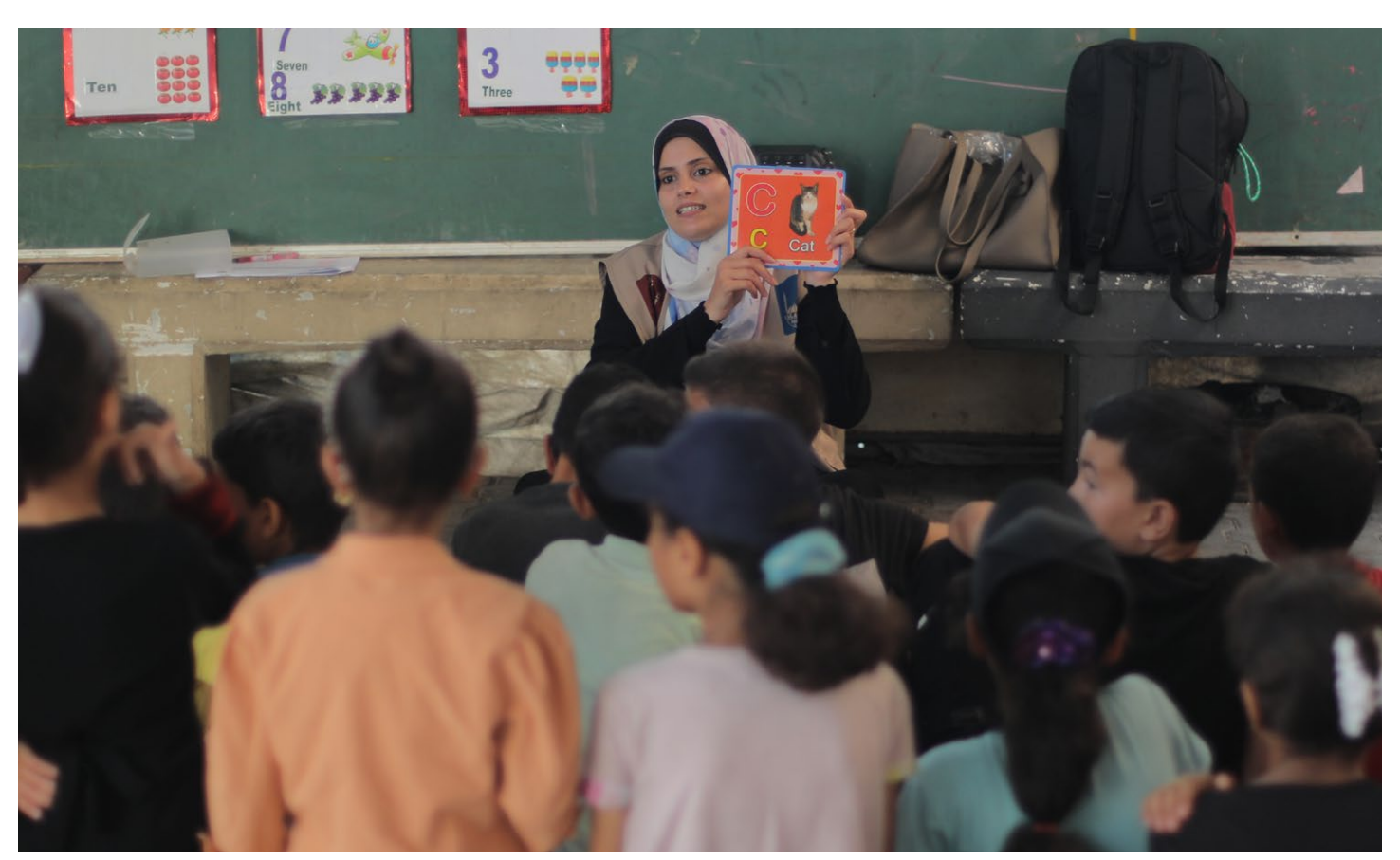
Education is the fundamental building block of a brighter future and Islamic Relief plans to support children back into formal education

We also raised the standard of teaching and care for preschool children by furnishing kindergartens and helping them adopt a new curriculum. In 2018, we provided training and mentoring for teachers and up-to-date learning resources using smart devices to support the cognitive, social, emotional and educational development of 8,400 children.