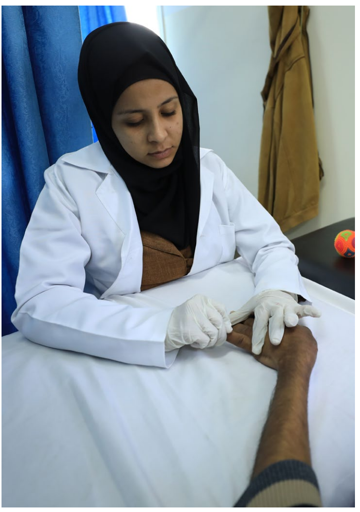
A healthcare worker examines a patient

In 2012, as part of our emergency response to another round of conflict, we mobilised quickly to deliver £1 million worth of medical supplies to hospitals which allowed them to treat incoming casualties. In 2020, we established a project to diagnose health issues in children and provide life-changing treatment and rehabilitation services. This project helped over 30,000 children to thrive in school and at home, as well as improving their self-esteem and psychological wellbeing.