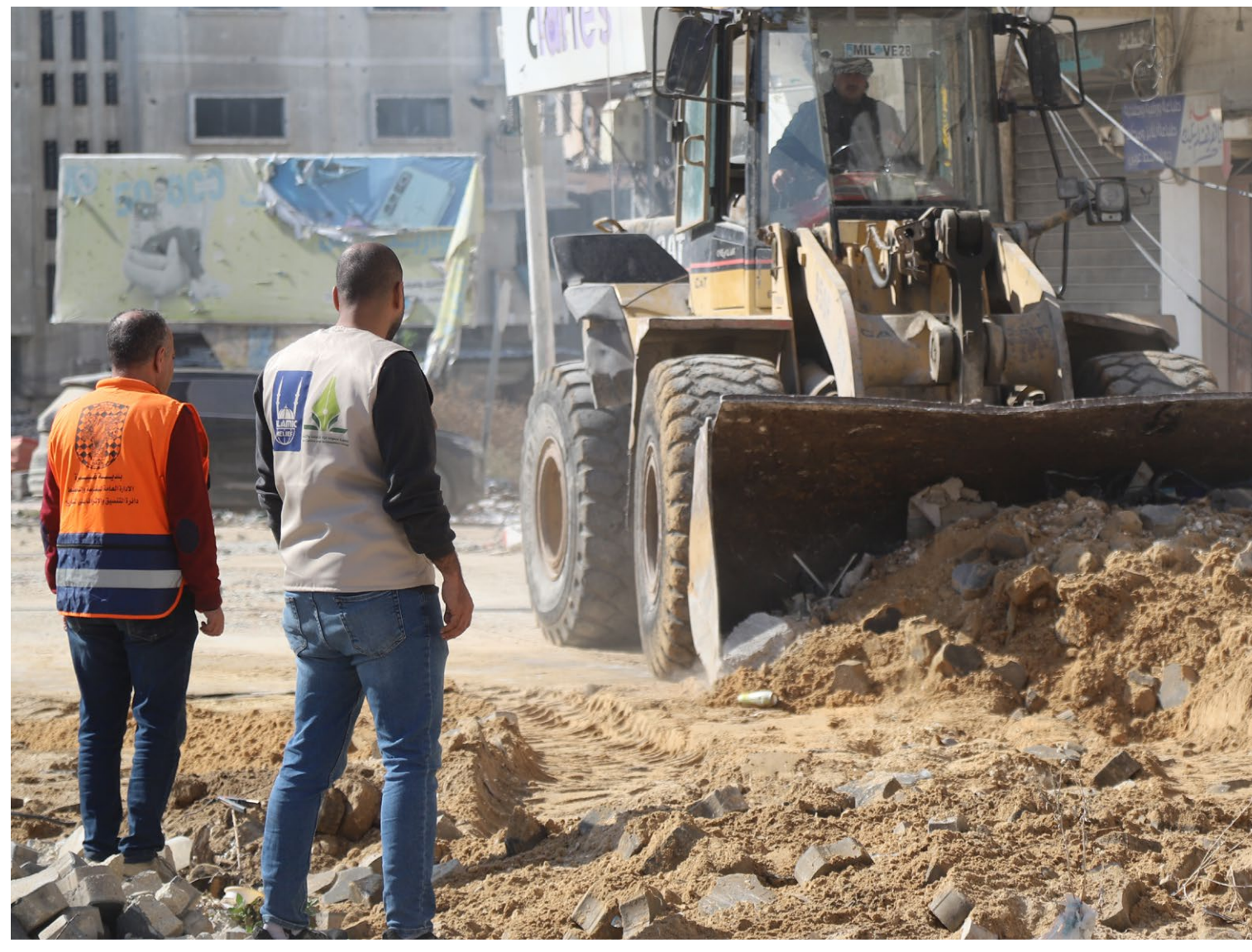
Islamic Relief was among the first humanitarian organisations to begin clearing rubble when the ceasefire was announced in January 2025