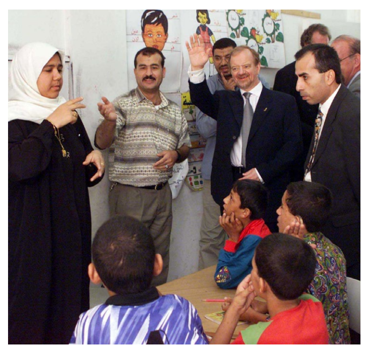
The then UK Foreign Secretary Robin Cook attends the opening ceremony of an education centre set up by Islamic Relief in Deir El Balal Camp in 1998

In 2017, our funding improved health services for children at two special needs schools in Gaza, by installing treatment devices in physiotherapy rooms, furnishing classrooms and libraries, and providing equipment and games to assist children with disabilities.