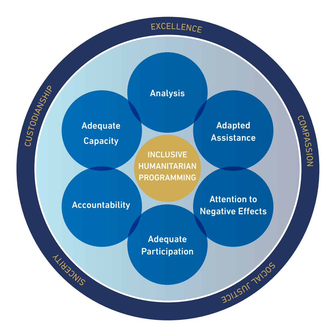
Diagram 2: IRW's Intersectionality Framework – the 6 A's approach